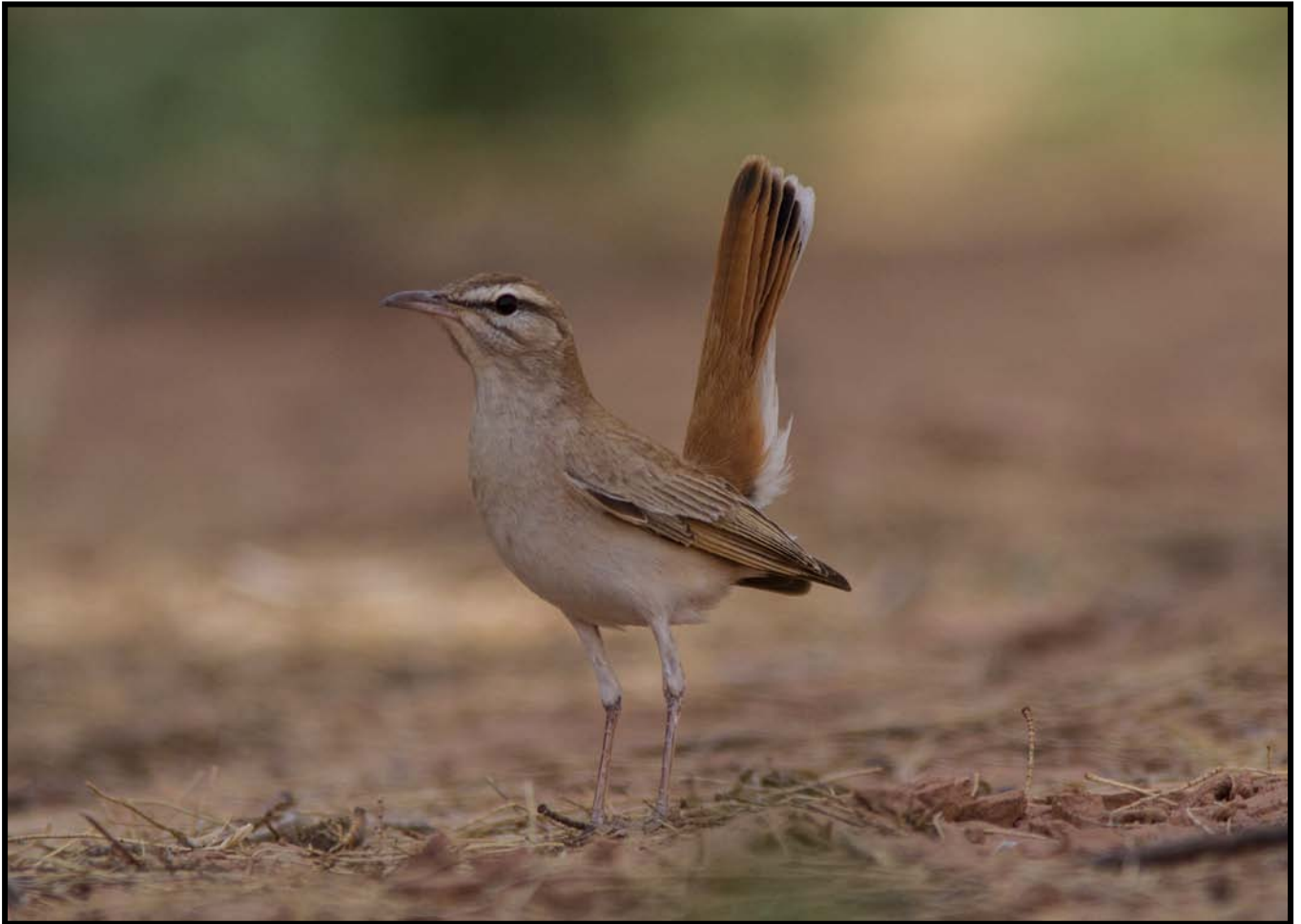
Rufous Bush Robin, nr Ar-Rachidia, 24.05.13