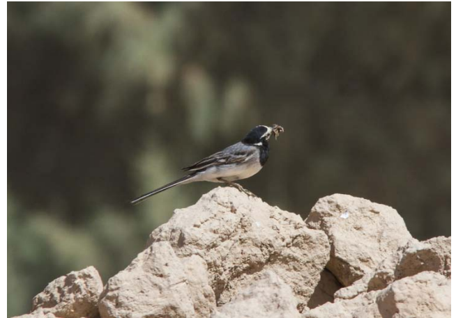
Moroccan (White) Wagtail , Rissini, 25.04.13

Saturday 25th May: Birding started at breakfast with another Western Olivaceous Warbler on the terrace. The wind had gone up overnight and made exploration of the tamarisks around the hotel difficult. In addition to late migrants in the form of Spotted Flycatcher and Melodious Warbler there were . We settled our bill and headed back to the tarmac road with one stop which provided Desert and Hoopoe Larks . Rissini was less busy than the night before and after parking by the football stadium just before the bridge we explored the riverside tamarisks (Gosney p8) which were full of nesting Saharan Olivaceous Warblers . Meanwhile Blue-cheeked Bee-eaters patrolled the dry river bed and both White-crowned Black Wheatear and Moroccan Wagtail were visiting nest sites in the walls of the stadium.