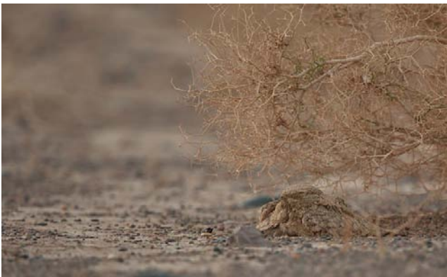
Egyptian Nightjar , near Rissani, 24.05 13

under stunted acacias for roosting birds. The sun had already set when Nick noticed Graham waving frantically ca 500m away and simultaneously received the immortal text - " got one roosting ". We sat quietly and watched an exquisitely camouflaged female until last light when she eventually half-opened her eyes called briefly and flew over a nearby ridge. We walked back the car then found our way in the dark over the rutted piste to the famous Café Yasmina where we celebrated an outstanding day with a cold beer overlooking the moonlit Erg Chebbi dunes.