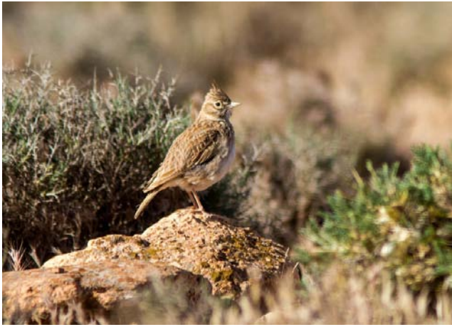
Thekla Lark , Zaida Plains, 24.05.13

Friday 24th May:- We were on the Zaida plains shortly after first light and immediately found a pair of Desert Wheatears but there was no evidence of singing Dupont's Lark. We birded the plains for the next 2-3 hours and turned up both Lesser and Greater Short-toed Larks, Thekla Lark, Thick-billed Lark , Red-rumped Wheatear and Trumpeter Finch whilst three Ruddy Shelducks flew over.