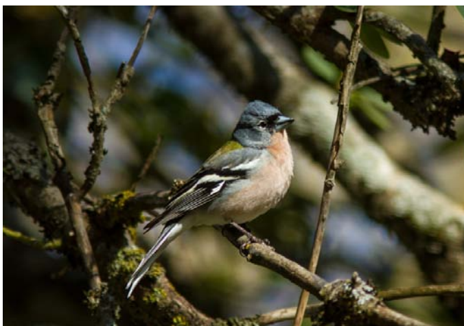
"African" Chaffinch, Near Ifrane, 23.04.13

We headed South during the last hour stopping twice; once to look at a perched Booted Eagle and again shortly after dark for a Maghreb Tawny Owl on roadside wires before pitching into the comfortable Ksar-Timnay Hotel for the night.