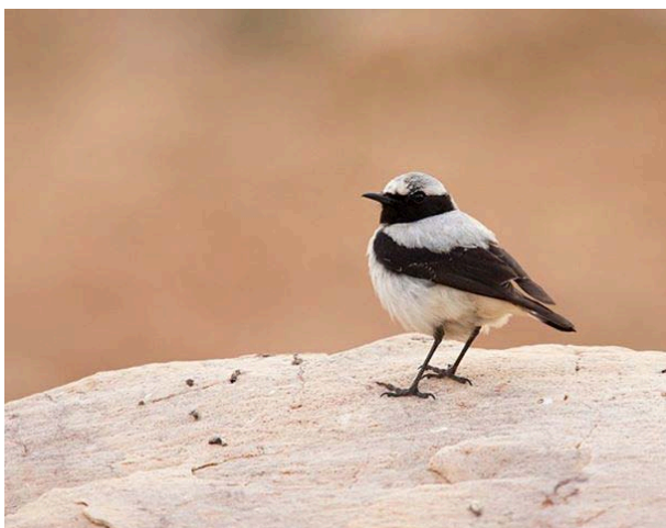
Seebohm's (Northern) Wheatear , Middle Atlas, 25.05.13

NB We have given GPS coordinates for the sights but would not recommend leaving the tarmac road without a guide - for three reasons: 1) The pistes are in very poor condition and you will need a guide to make sure you take only those that are passable especially if you don't have an off-road vehicle. 2) The owls use multiple roost sites and it is a massive cliff face - up to date information will save you a great deal of time 3) We would agree with Dave Gosney that it can only be good for locals to see there is a financial benefit to not disturbing these special birds