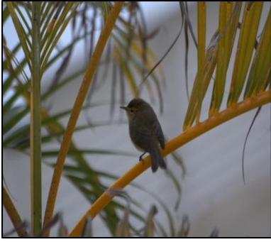
Canary Island Chiffchaff